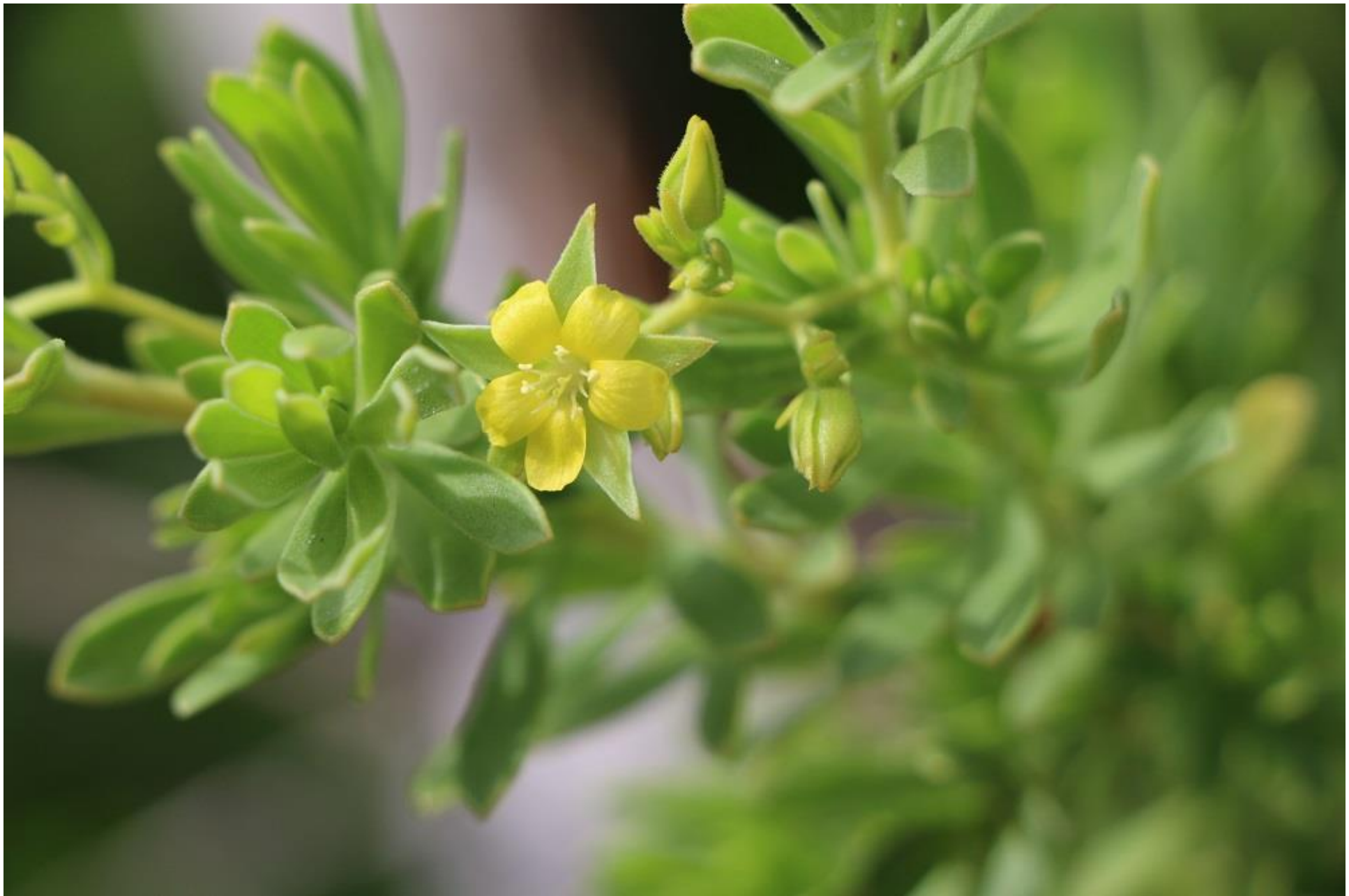
Bay Cedar Yellow Flowers that Bloom