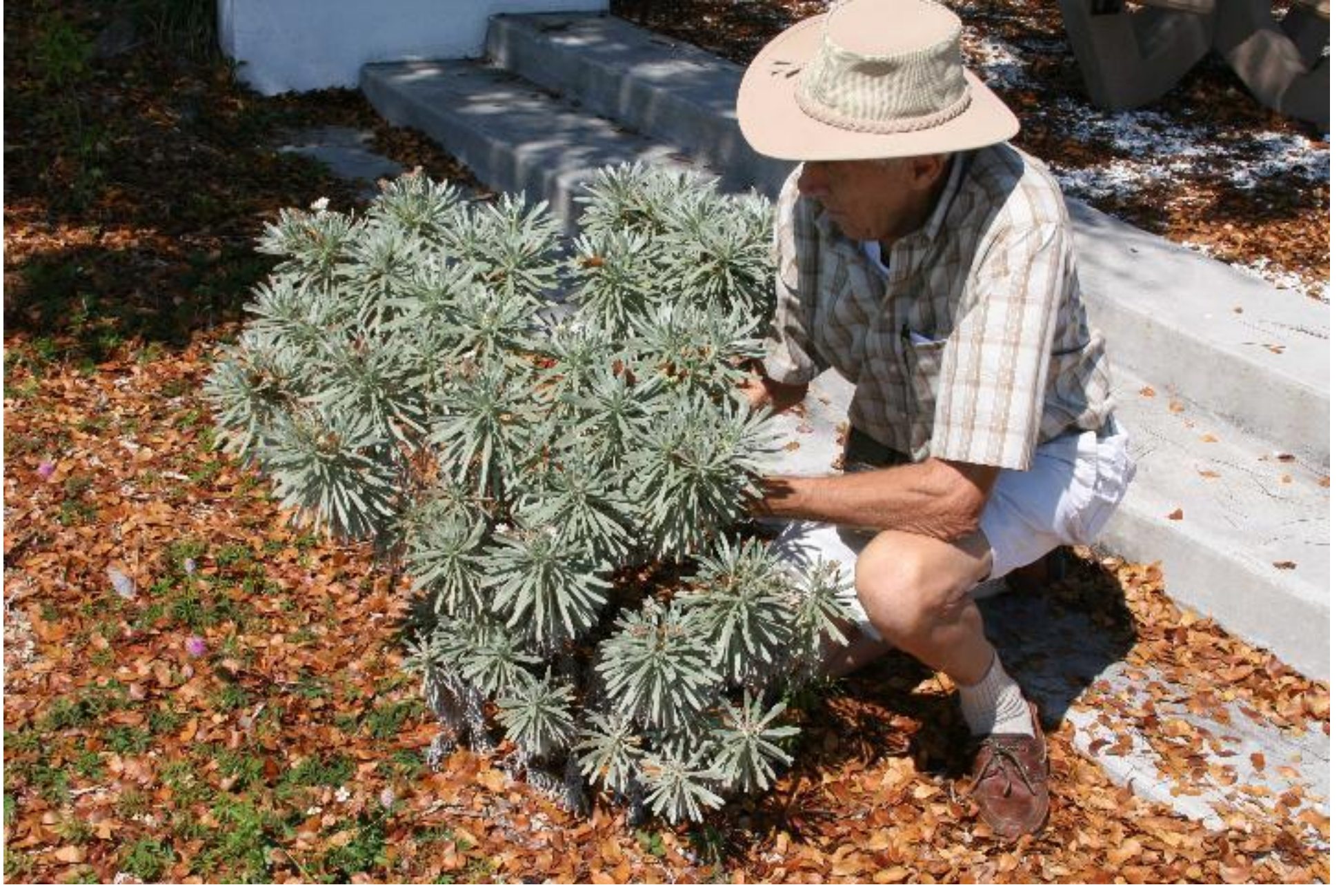
Sea Lavender ( Heliotropium Gnaphalodes )