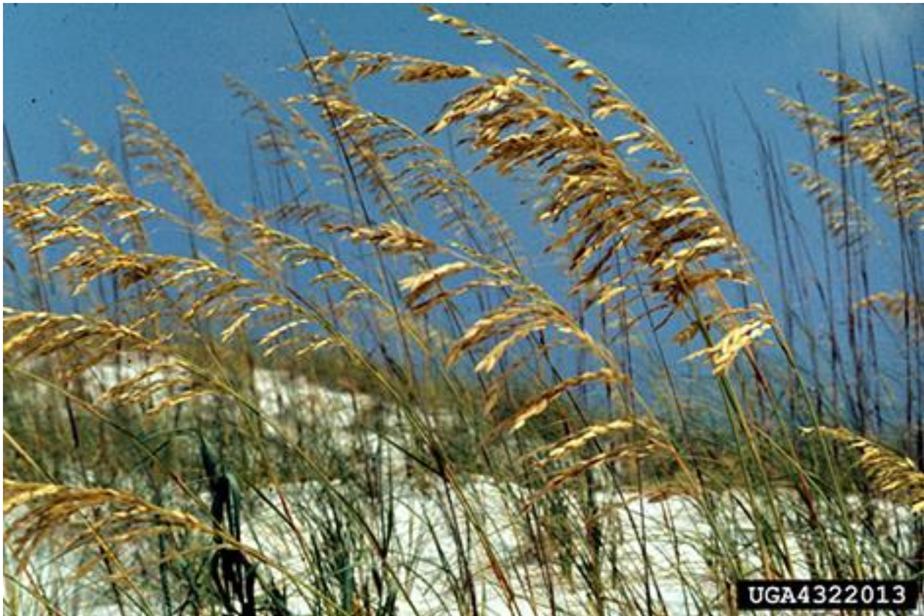
Sea Oats Uniola Paniculata