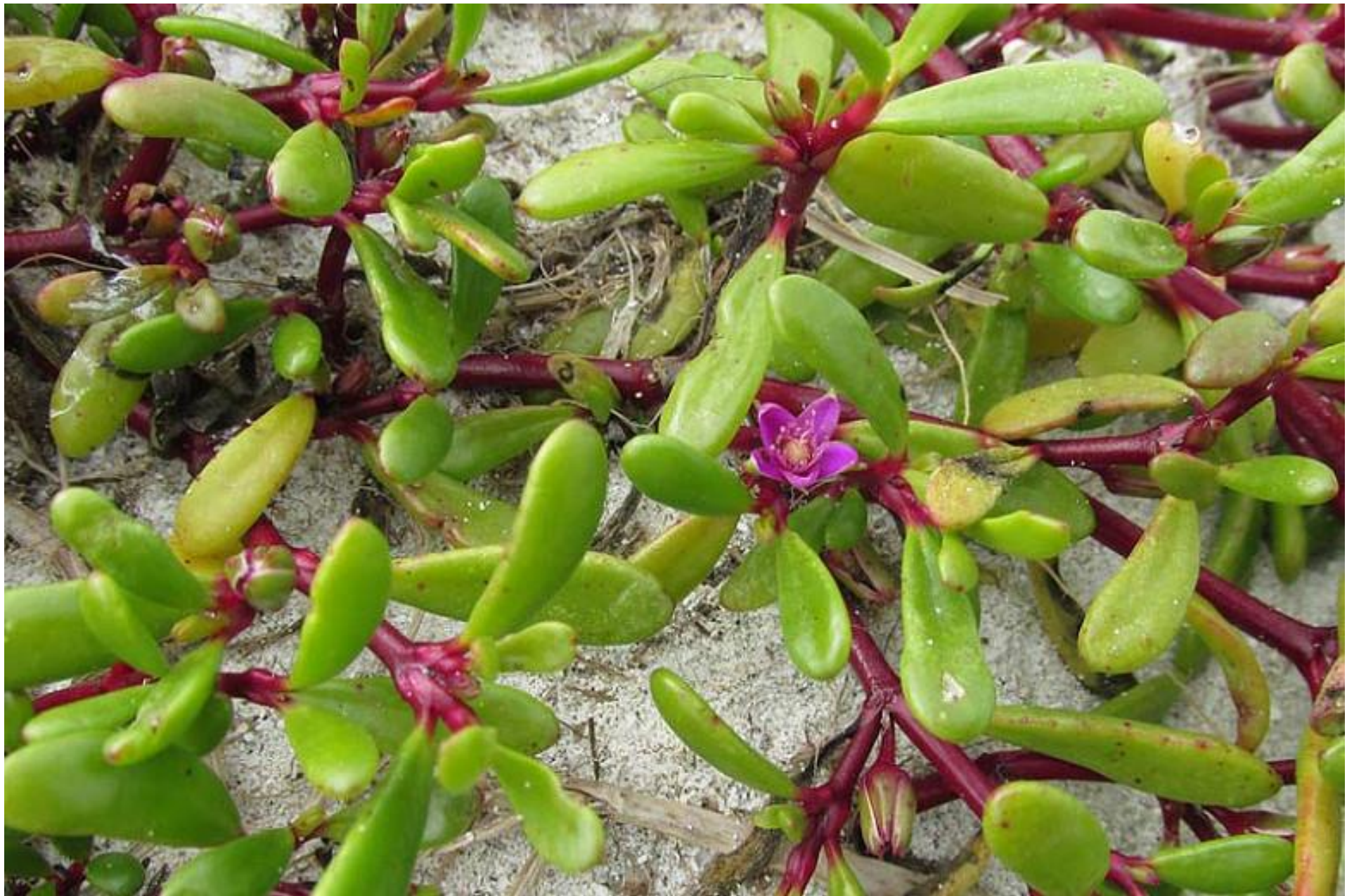
Sea Purslane ( Sesuvium portulacastrum )