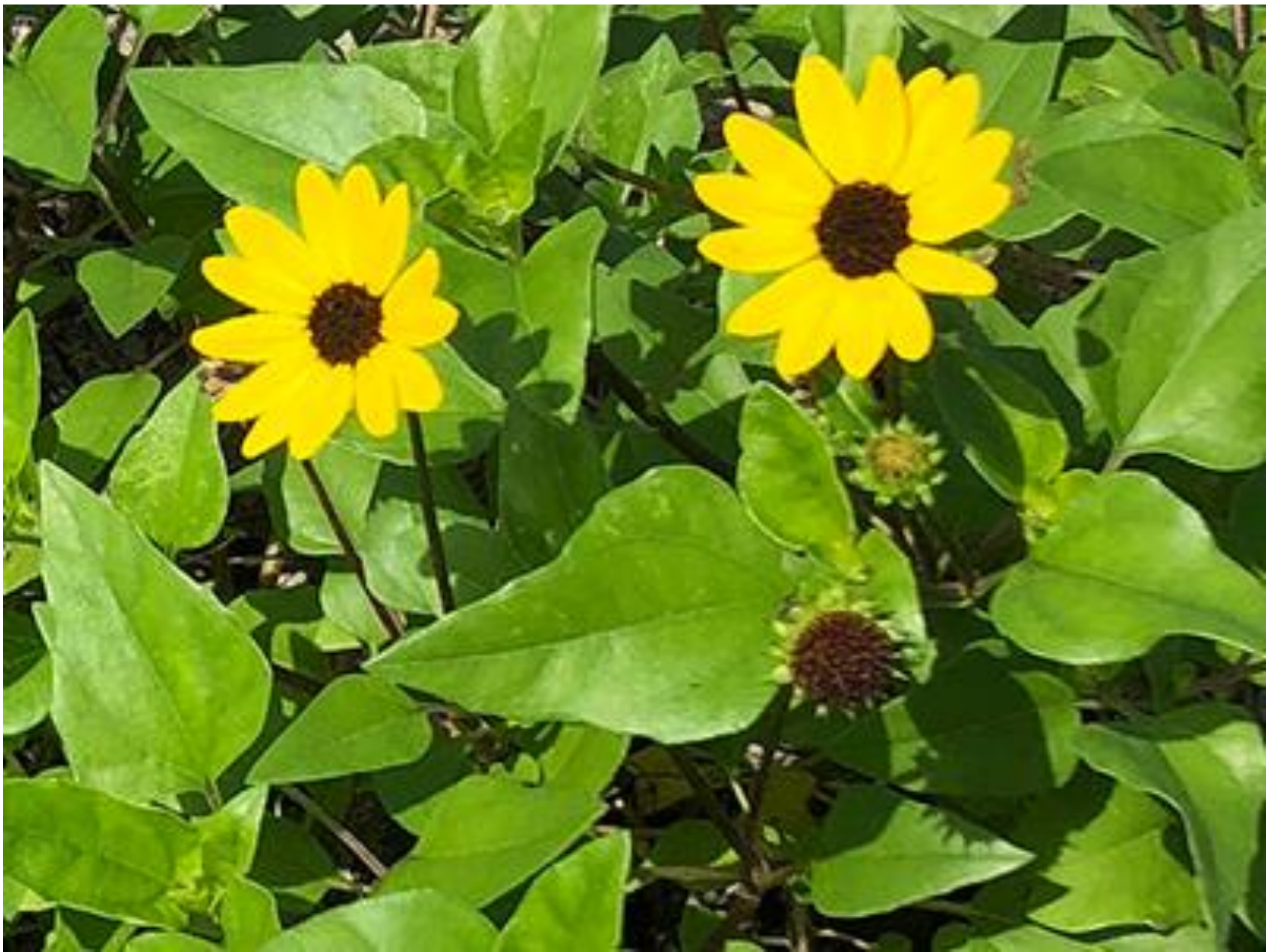
Beach Sunflower ( Helianthus debilis )