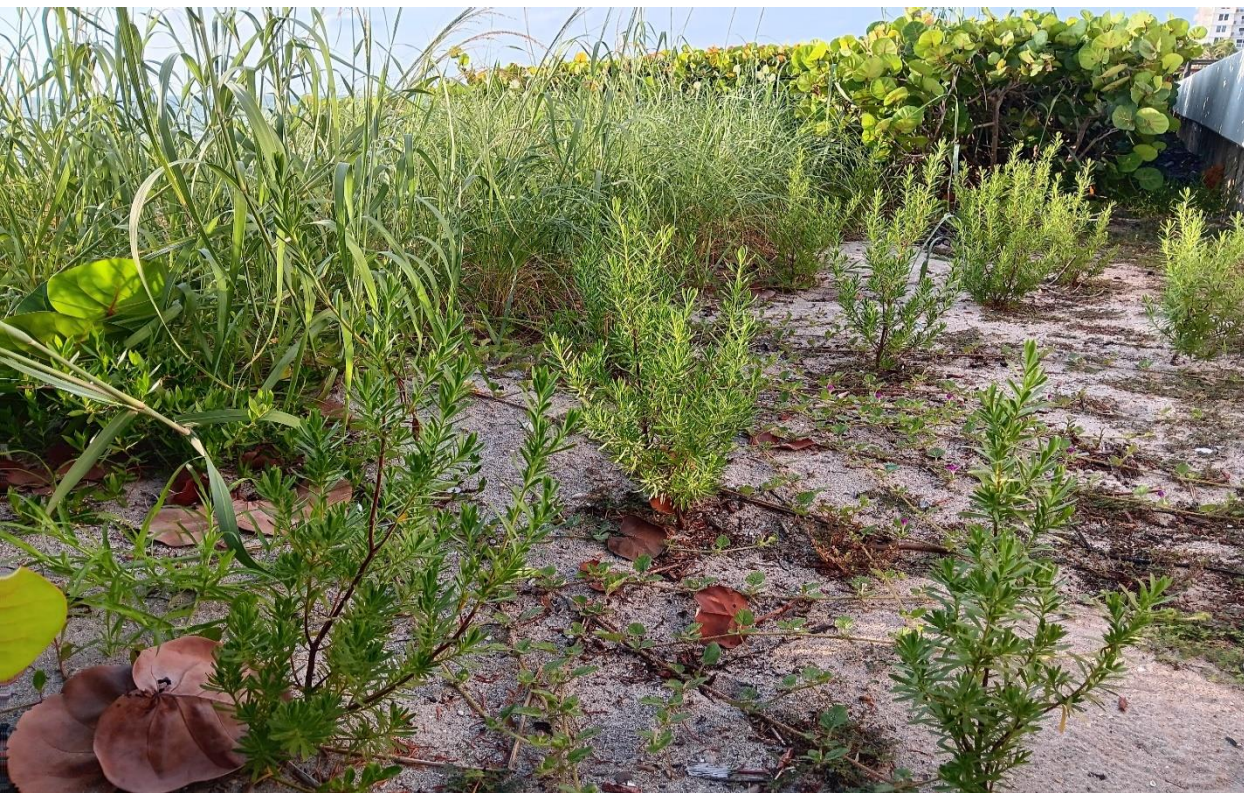
Bay Cedar Plants