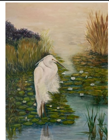
exhibit on display thru September 15